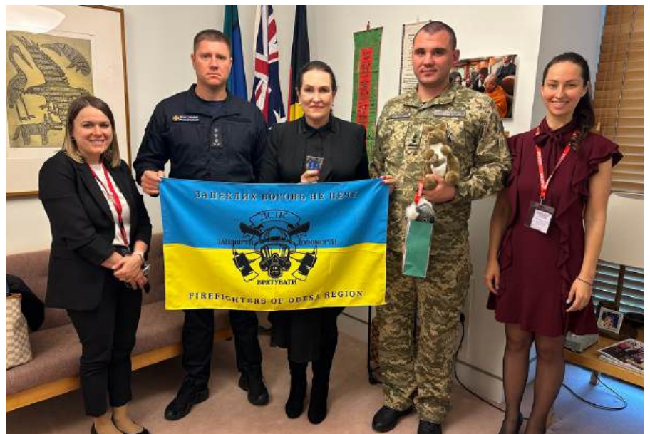
With Senator Deborah O'Neill