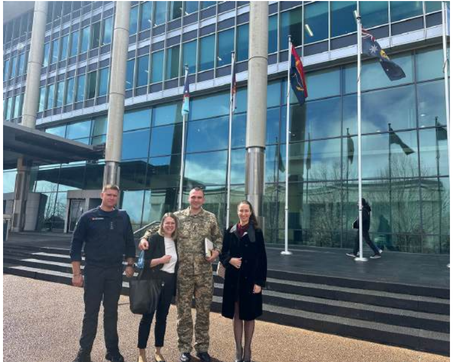
Australian Defence Force Headquarters