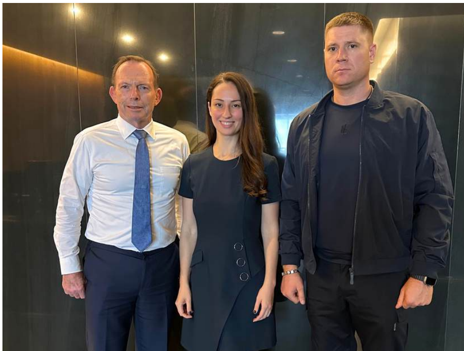
With Former Prime Minister Tony Abbott AC