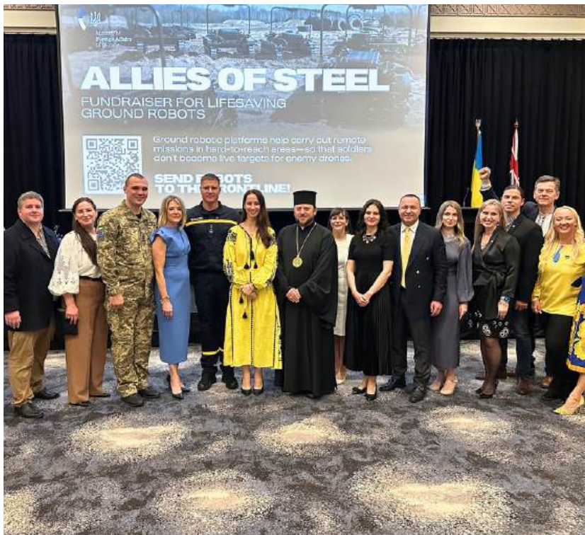
Ukraine Independence Day 2025 Ukrainian Embassy Reception, Canberra