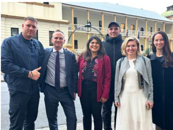
Parliament of New South Wales