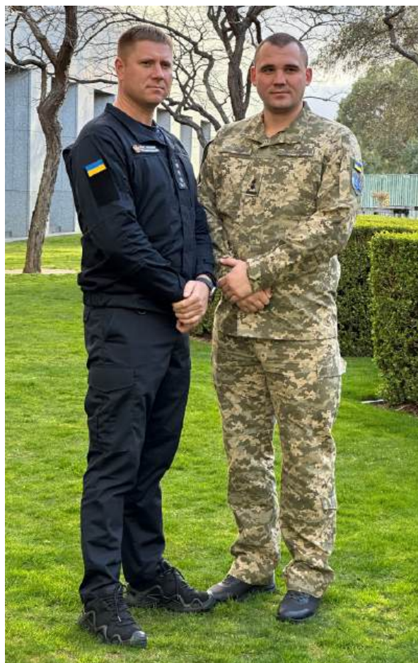
Sydney Morning Herald interview