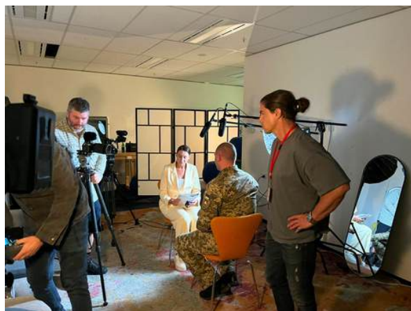
Channel 10 interview