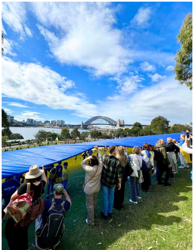
Unfurling of the largest Ukrainian flag in the World.