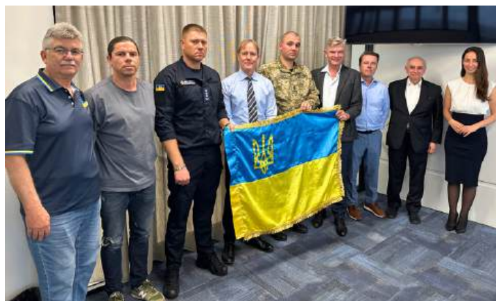
Roberts Pike Foundation