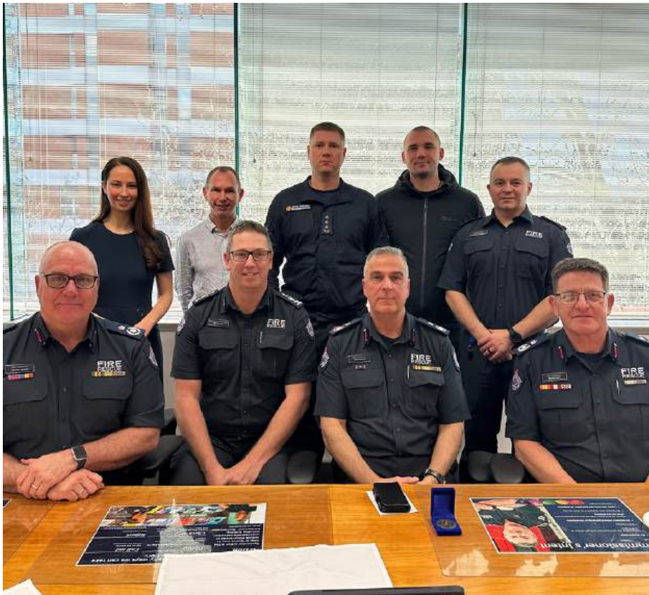
Fire Rescue Victoria