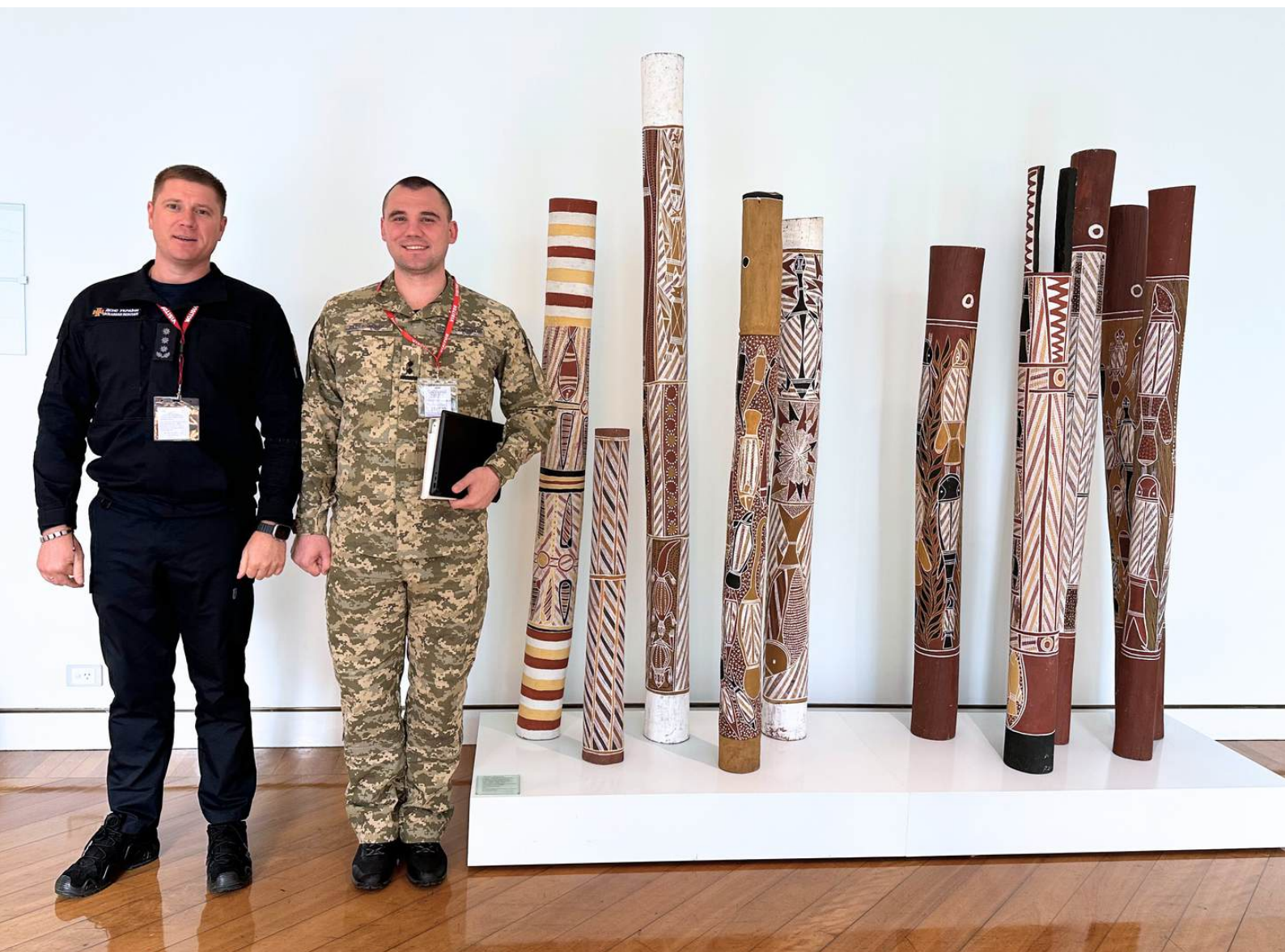
Parliament House, Canberra