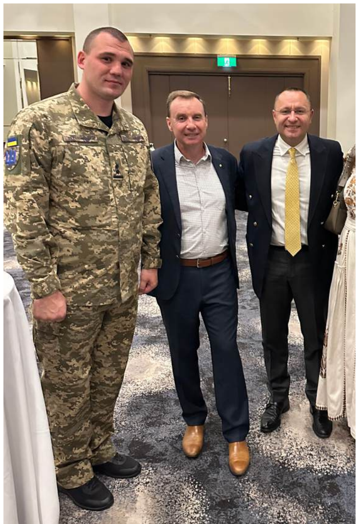
With Major General (ret.) Mick Ryan and His Excellency Vasyl Myroshnychenko