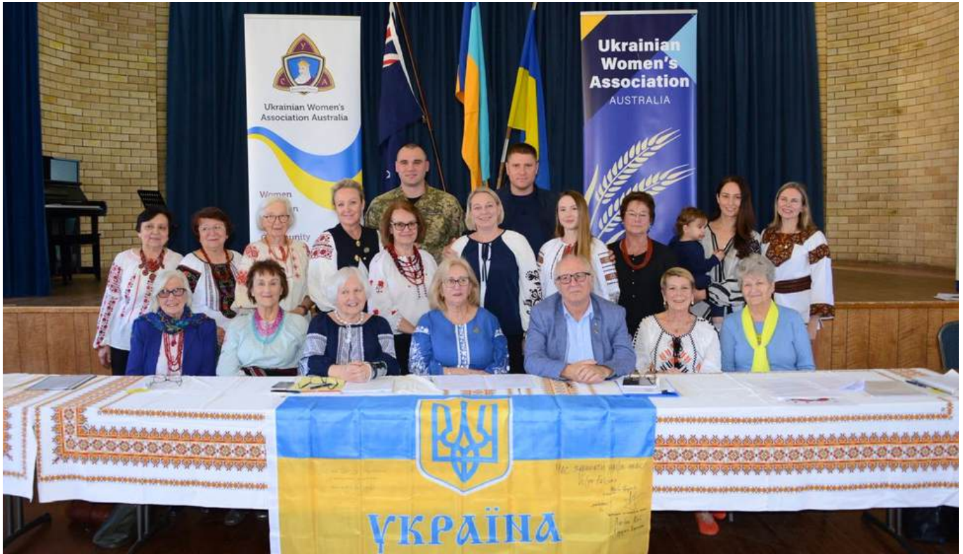
Ukrainian Women's Association of New South Wales - Annual General Meeting