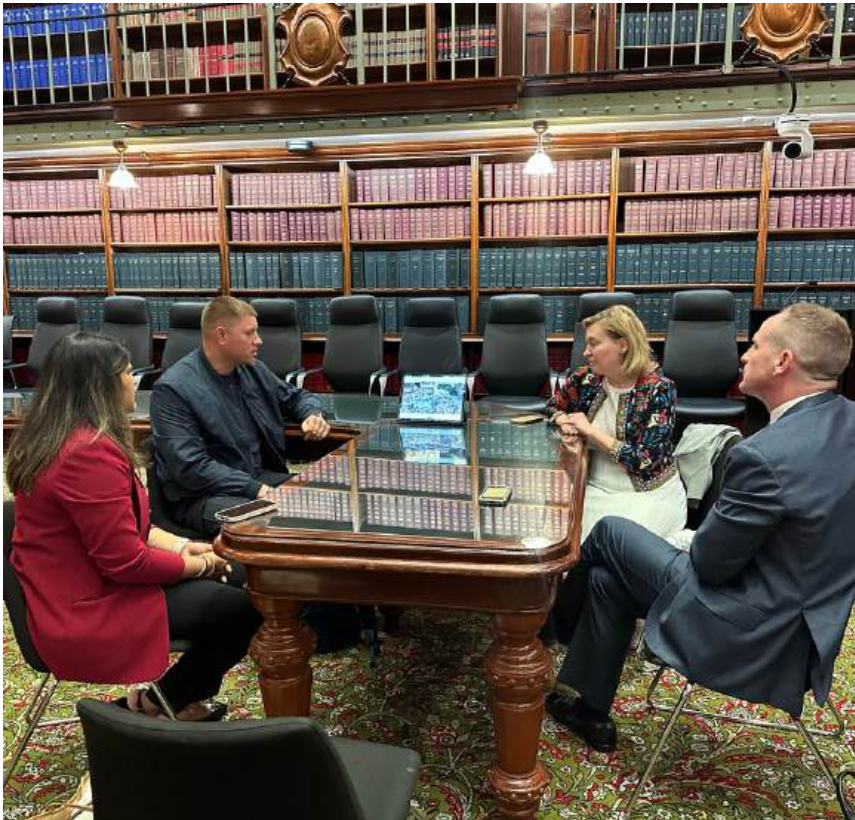
Parliament of New South Wales