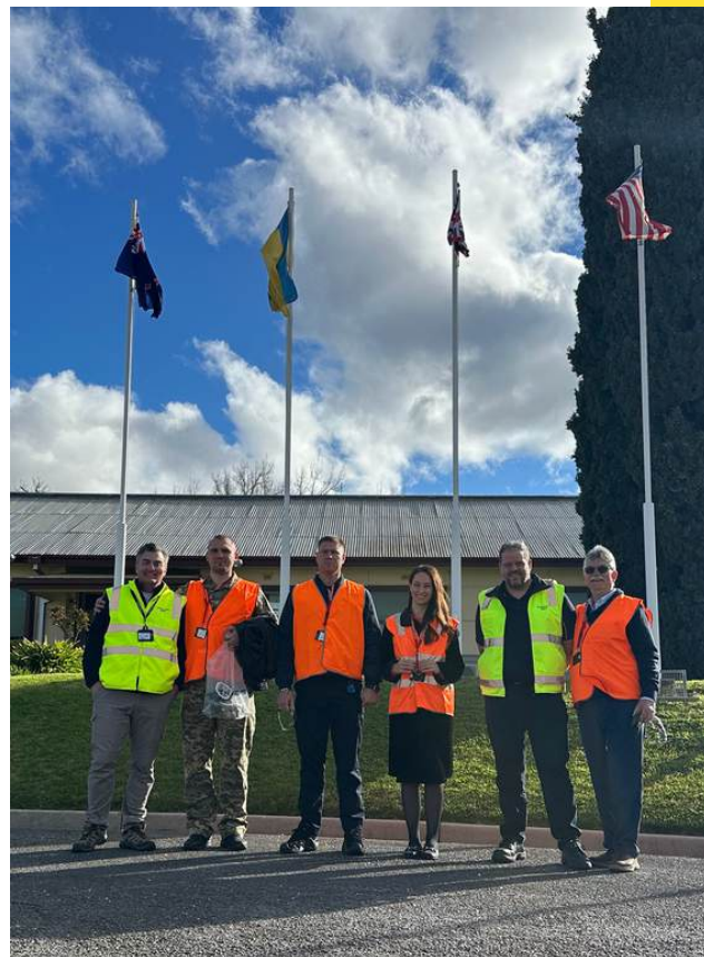
Thales - Bushmaster manufacturing facility