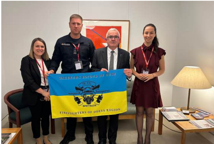
With the Hon Andrew Wilkie MP