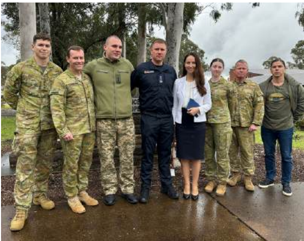
Australian Defence Force