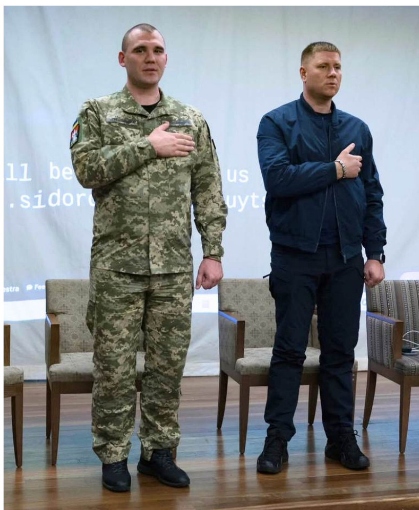
Sydney Community meeting.