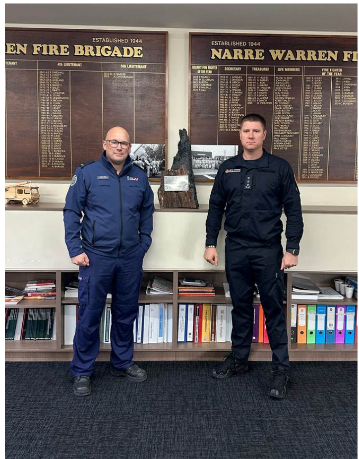
Narre Warren Fire Station