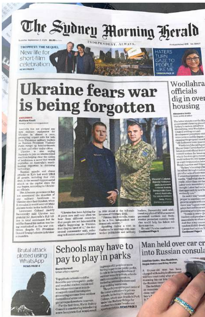
Front cover of the Sydney Morning Herald