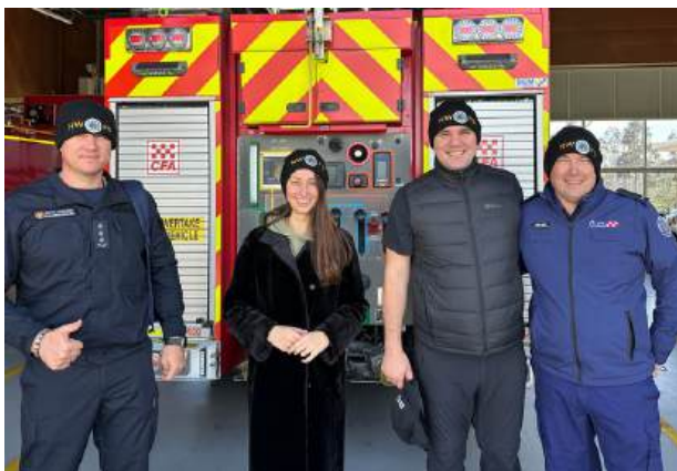
Narre Warren Fire Station