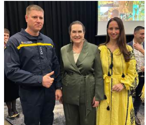
With Senator Deborah O'Neill, Canberra