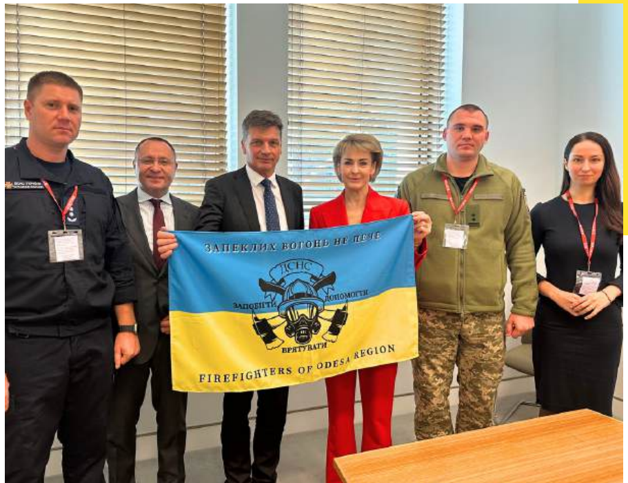
Shadow Minister for Defence, the Hon Angus Taylor and Senator Michaelia Cash, Shadow Minister for Foreign Affairs and Trade