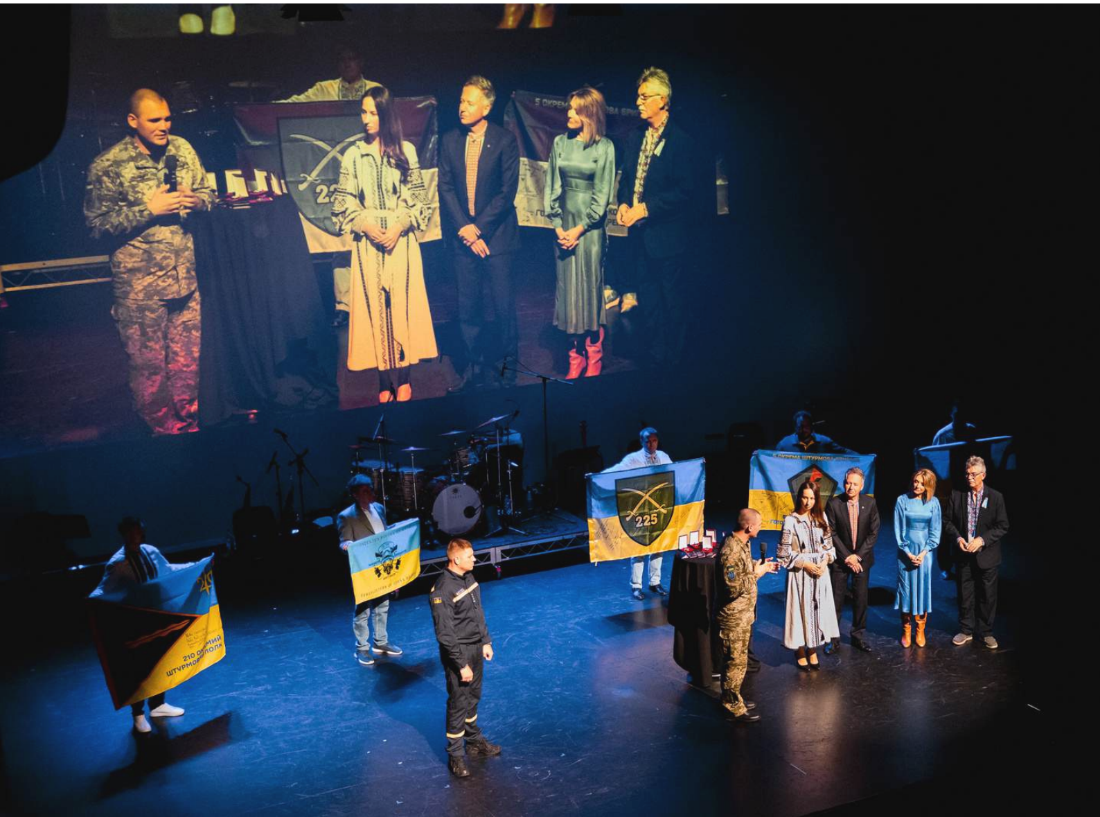
Parliament House, Canberra.