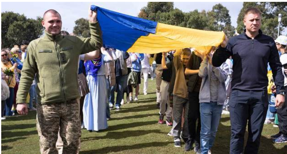
Largest Ukrainian Flag in the World - Unfurling at Barangaroo, Sydney - 24 August 2025.