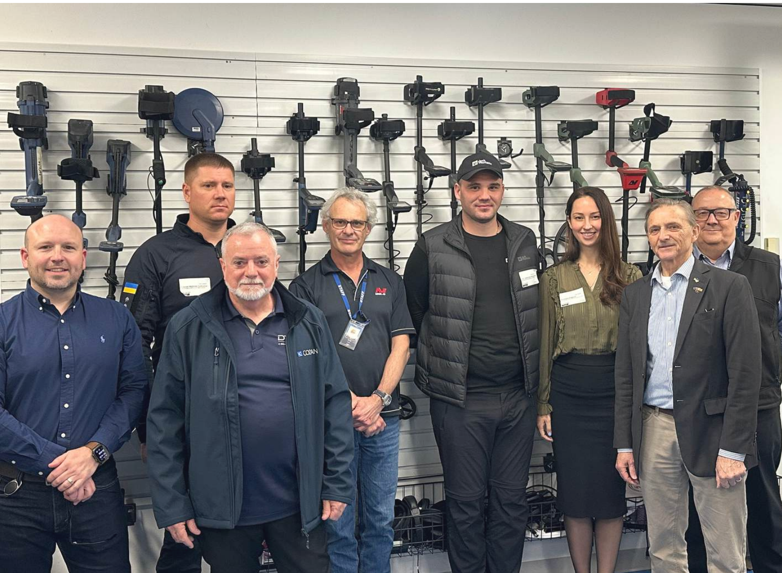
Codan / Minelab

The delegation engaged with a broad scope of stakeholders, meeting with investors, equipment manufacturers and engineering labs, confirming strong industry interest in supporting Ukraine through local manufacturing, technology transfer, collaboration and training, and potential on-the-ground exchanges.