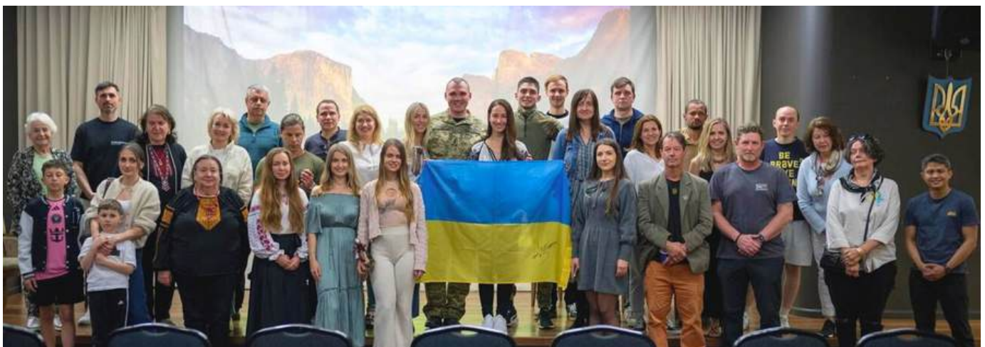
Sydney community meeting.