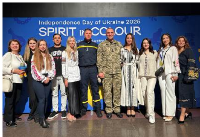
Spirit in Colour - Ukrainian Council of NSW's Independence Day