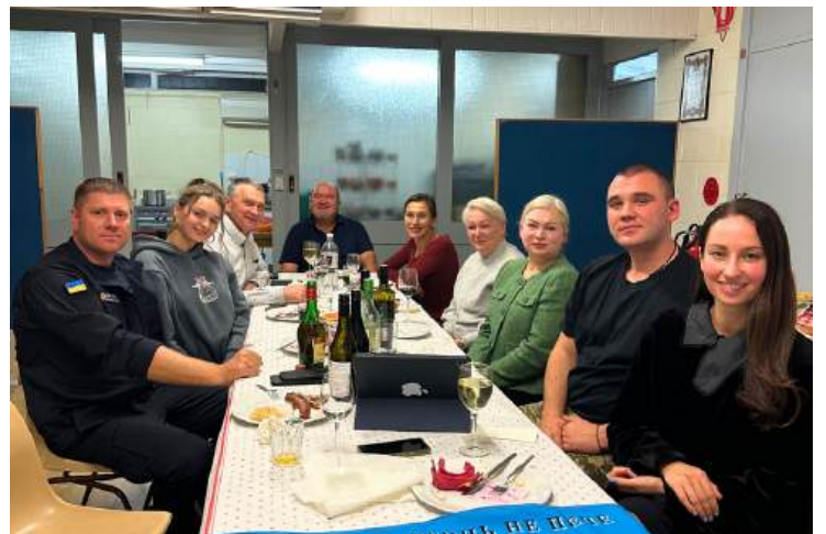
Canberra community meeting