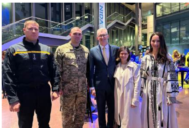
With the Hon Tony Burke MP, Minister for Immigration and Citizenship