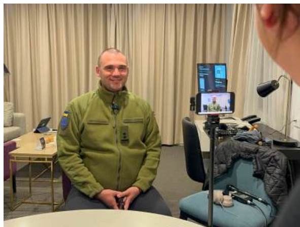
ABC Radio interview