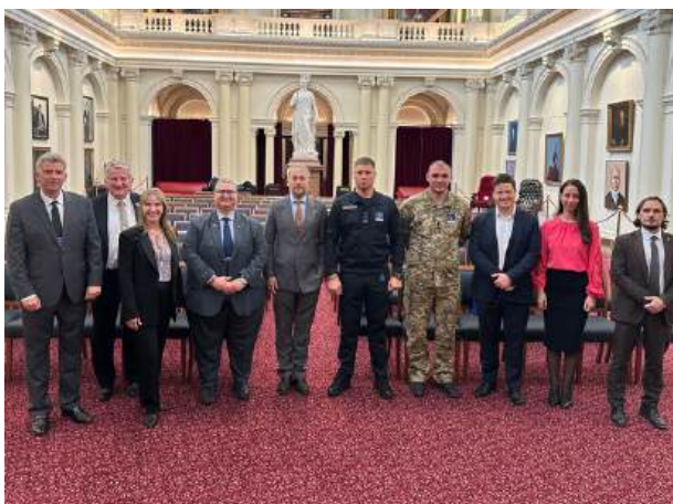
Parliament of Victoria