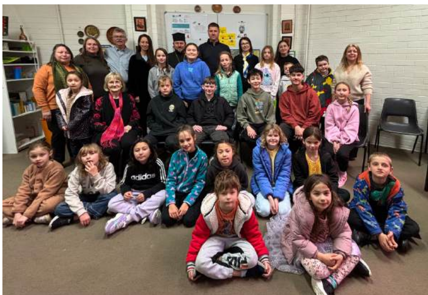
Ukrainian Parish School, Melbourne