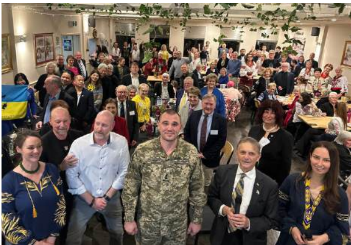
Association of Ukrainians in South Australia (AUSA) Independence Day