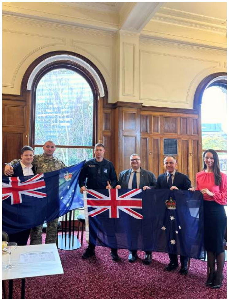
With members of the Victorian Parliamentary Friends of Ukraine Group