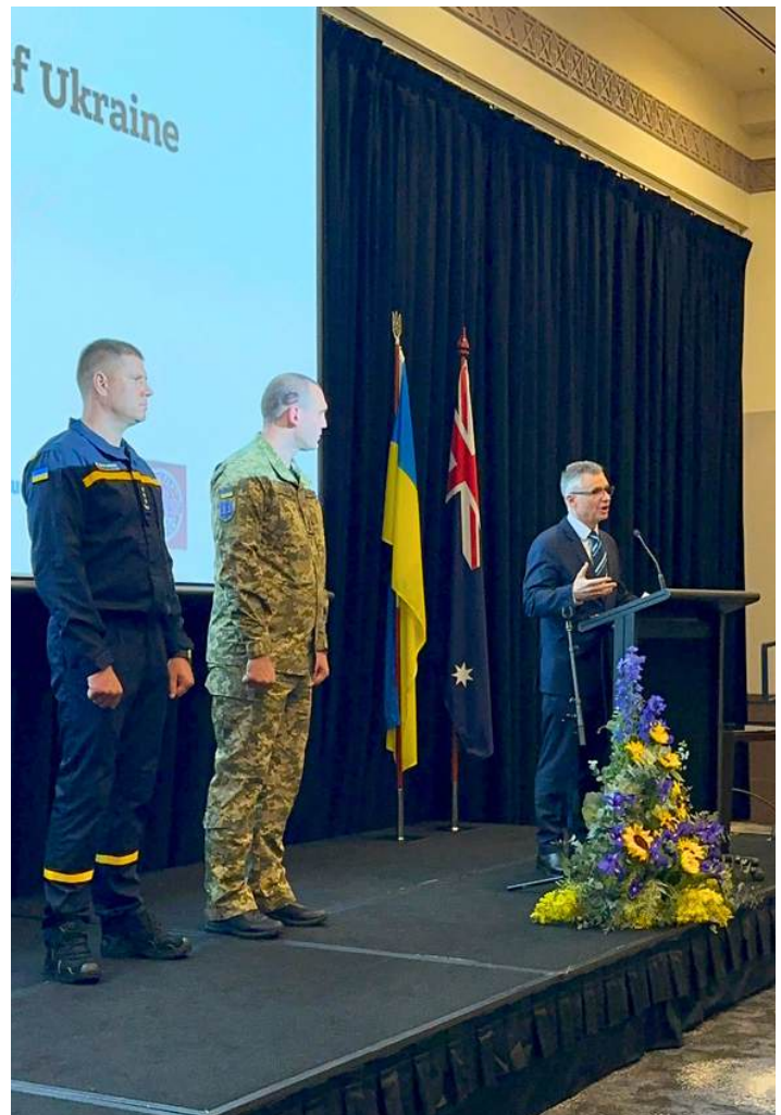
Ukrainian Embassy Reception, Canberra