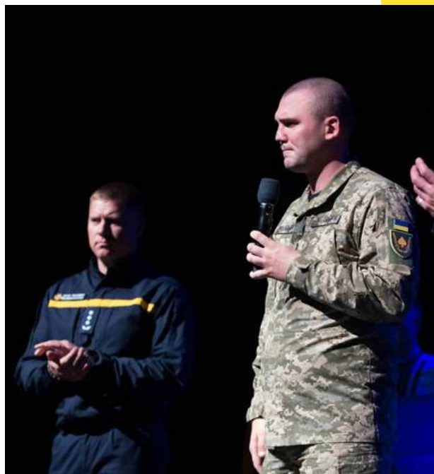
UCNSW's Spirit in Colour - Independence Day.