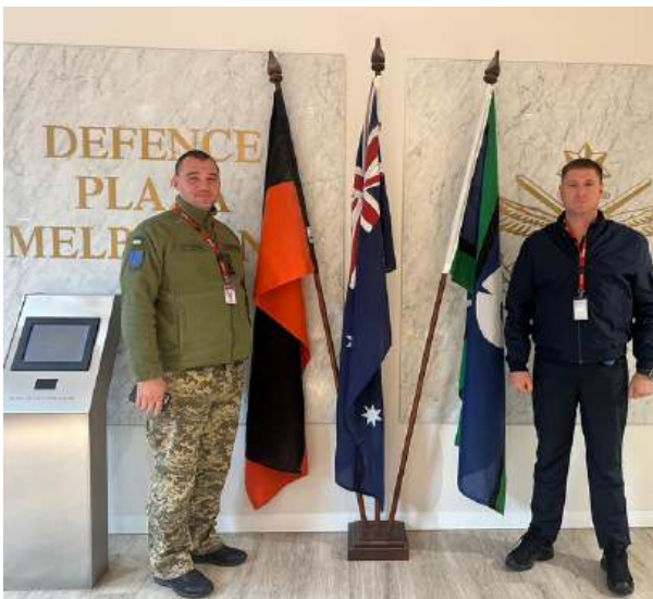
Defence - Battle Lab