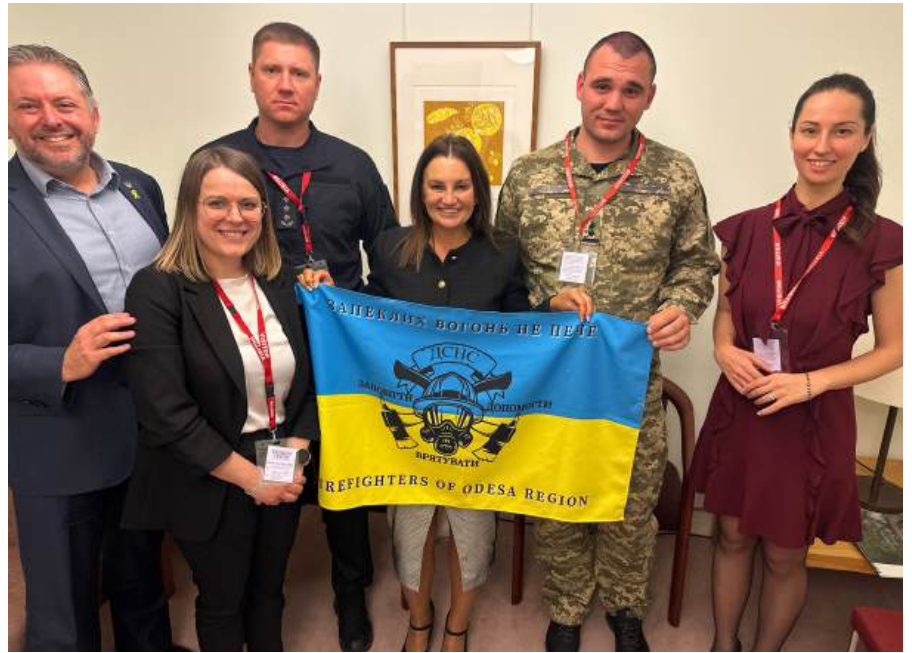
With Senator Jacqui Lambie