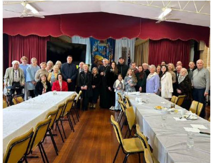
Ukrainian Orthodox Church, Melbourne - community meeting