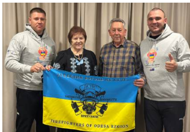
Meeting with Ukraine Crisis Appeal