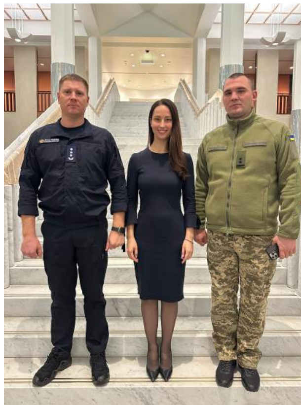
Marble Foyer, Parliament House, Canberra

Moving forward, the foundations laid during this tour will enable stronger defence collaboration, industry partnerships, and community engagement, reinforcing Australia's role as a steadfast partner in Ukraine's survival and eventual victory.