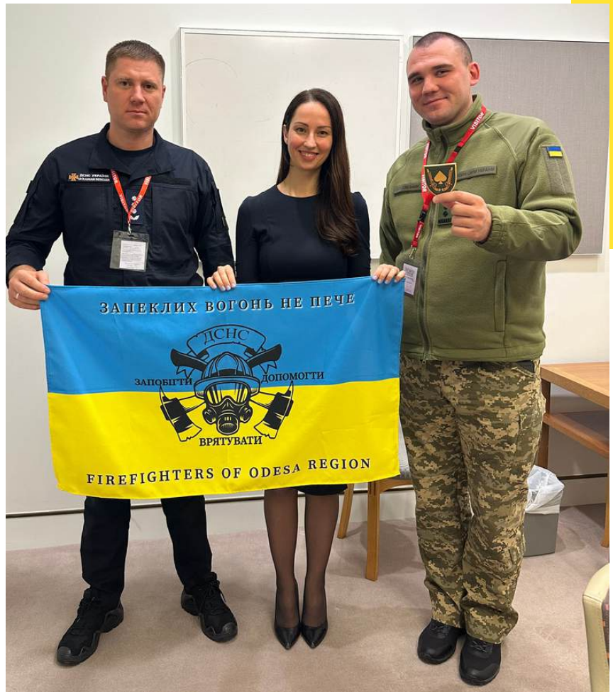
Office of the Minister for Foreign Affairs and Trade