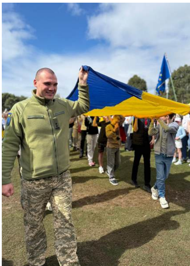
Largest Ukrainian Flag in the World - Unfurling at Barangaroo, 24 August 2025.