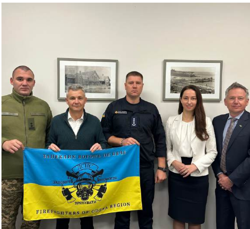
Meeting with Hon Matt Thistlethwaite MP, Assistant Minister for Foreign Affairs and Trade.