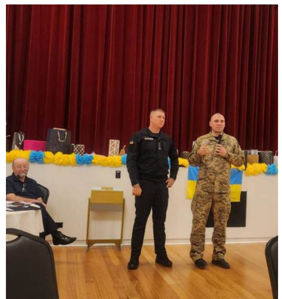
Speaking at Ridnyi Krai dinner, Melbourne