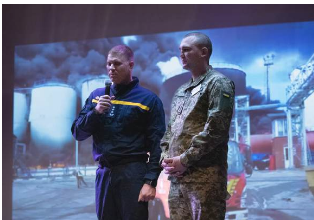
Association of Ukrainians in South Australia (AUSA) - Independence Day.

The tour demonstrated that Ukraine's fight for sovereignty resonates deeply in Australia – not only as a matter of international security, but also as a shared struggle for resilience, freedom, and democratic values.