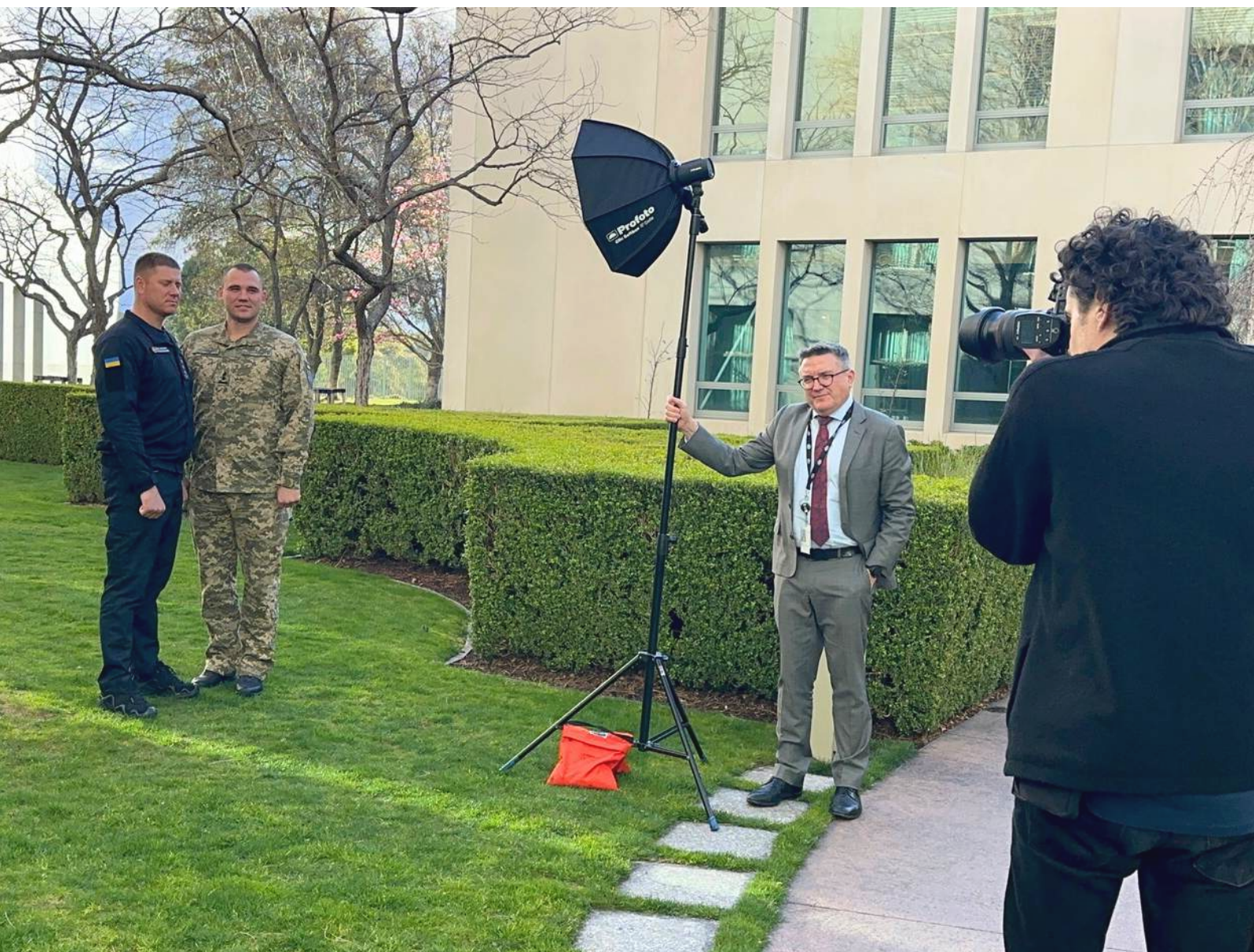
Sydney Morning Herald interview

The advocacy tour gained significant media coverage across national TV, radio, print and online, amplifying Ukraine's voice in Australia. This strong media presence ensured Ukraine's military and humanitarian needs remained front-of-mind for the Australian public, politicians, and decision-makers.