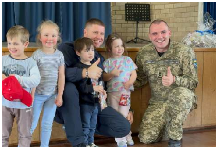
St Andrew's Ukrainian School, Sydney