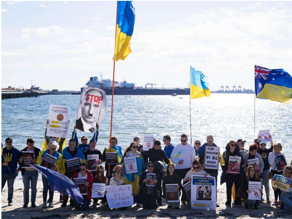
A group gathered to protest the arrival of the latest tanker.