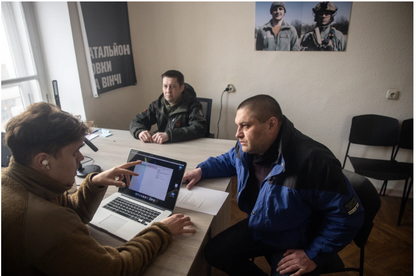
A 39-year-old man is interviewed for recruitment into the DaVinci Wolves Battalion.

“Compromise, if it comes, will be a forced one, something beaten out of the opponent,” he says.