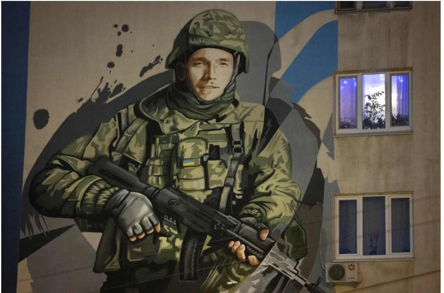
A Kyiv mural memorialises Andriy Ogorodnik, 23, an Azov Brigade member killed in the defence of Mariupol in 2022.

Ukraine doesn't release casualty figures, but the toll is growing.