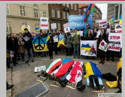
Better than a thousand words...

NEWSLETTER ON RUSSIAN OCCUPATION OF CRIMEA