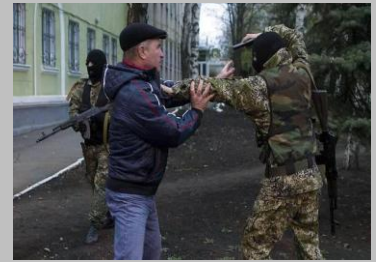
Video showing Russian special-ops pushing away and intimidating “pro-Russian” citizens in Kramatorsk:

Dispelling Putin's lies about Crimea and Ukraine. If you are seeking objective information on Russia's war on Ukraine, if you don't want to fall victim to Russian propaganda, visit www.stopfake.org – Russian/English