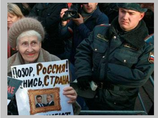
The anti-war rally in Moscow: "Actions of Putin and Medvedev are Russia's shame!"