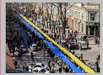
Ukraine United In Odessa: Anti-War Rally in Port City

NEWSLETTER ON RUSSIAN OCCUPATION OF CRIMEA