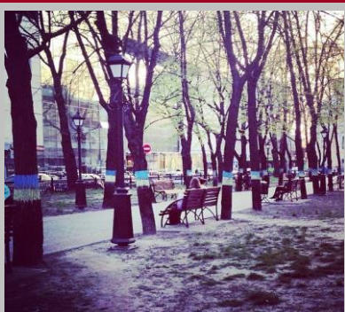
Kharkiv is for the United Ukraine!

NEWSLETTER ON RUSSIAN OCCUPATION OF CRIMEA