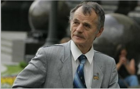
Mustafa Dzhemilev the Crimean Tatar leader was handed an official order barring him from returning to Crimea!