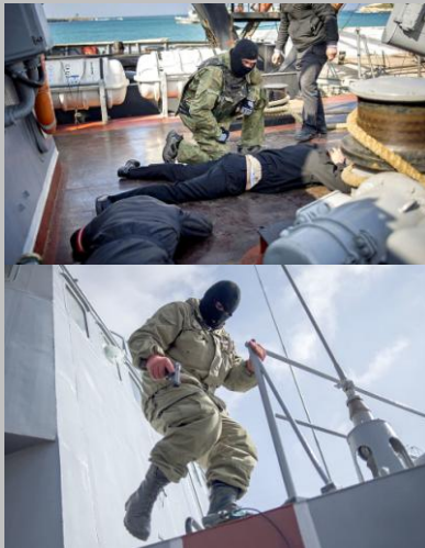
Russian “brothers” in action – taking over Ukrainian fleet

NEWSLETTER ON RUSSIAN OCCUPATION OF THE CRIMEA