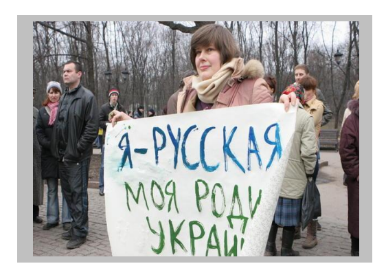
A rally in Kharkiv: "I am Russian. My homeland is Ukraine".