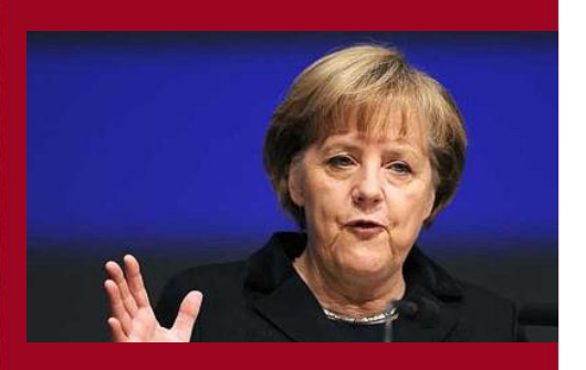
Merkel: "EU leaders ready to expand economic sanctions"