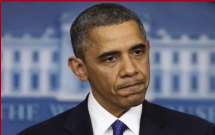
Obama : "Further provocations will do nothing except isolate Russia and diminish its place in the world".