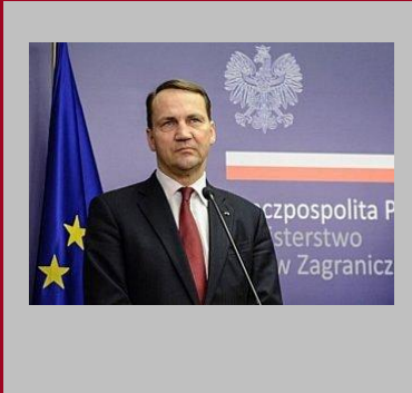
Sikorski: "Anschluss" won't remain unanswered