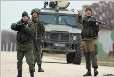
Crimean “referendum”. Under the guns of invaders