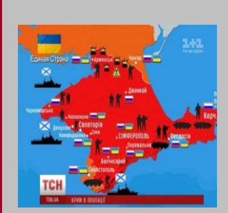
Russian Aggression. The map as of March 12

New rules by Crimea's puppet Prime Minister Aksyonov (a.k.a. Goblin):