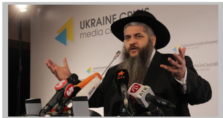
Chief Rabbi of Kyiv and Ukraine: there is no ethnic hate in Ukraine!

http://uacrisis.org/chief-rabbi-of-kyiv-and-ukraine-there-is-no-ethnic-or-religious-hatred-in-ukraine/